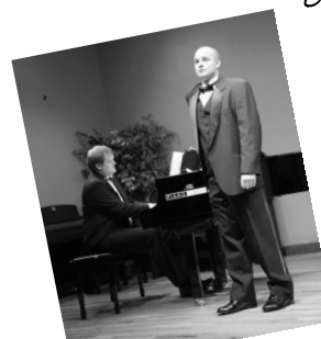
The Quest: A Decade of Song

August 12th Community Presbyterian Church American Fork, Utah